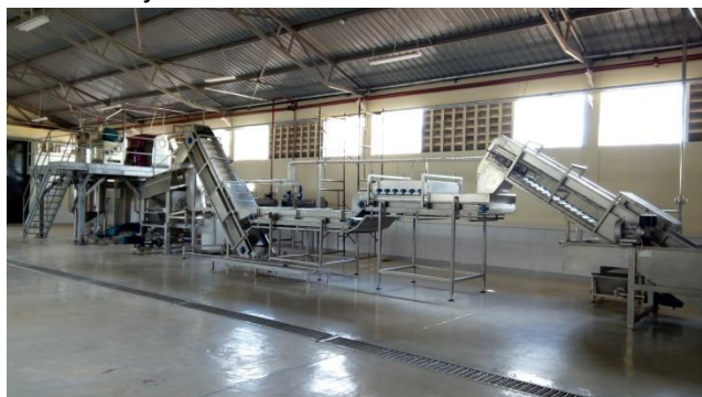
The mango processing plant in Makueni County

Makueni County: Rearing of mangoes and production of mango juice. The farmers do mango farming for sale and make juice from the ones that do not meet the