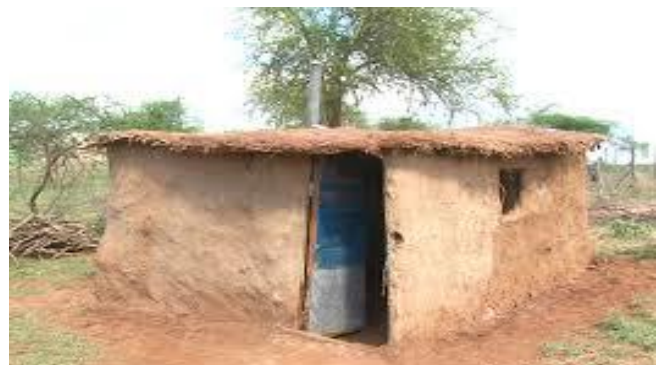
A maternity Manyatta in Kajiado County

would be used as a holding ground for mothers as they await their delivery date