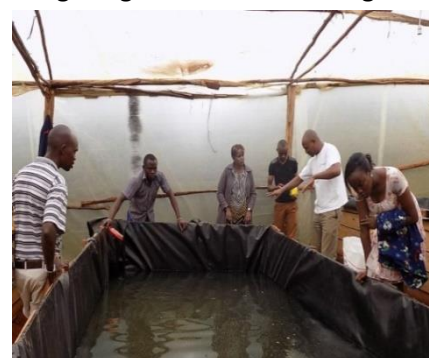
Fish farming in a greenhouse

Kiambu County: Rearing fish in a greenhouse. Some farmers have adopted this