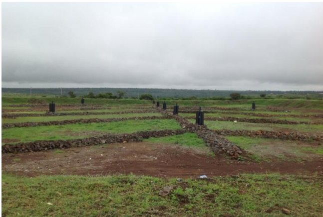
Landfill in Kiambu County

Kiambu County: Solid waste Management-Landfills. The county has consolidated a waste management method that involves consolidating waste through a series of pipes assembled at the bottom of the land fill, the taps are perforated to ensure optimum aeration and decrease the release of toxic gases. The pipes also allow leachate to easily discharge from the landfill into a secure retention pond before being transferred to a nearby sewage facility for treatment and release. It has a comparative advantage over other waste management formulae because 70-100 tons of waste will be managed daily in addition to a leachate treatment system.