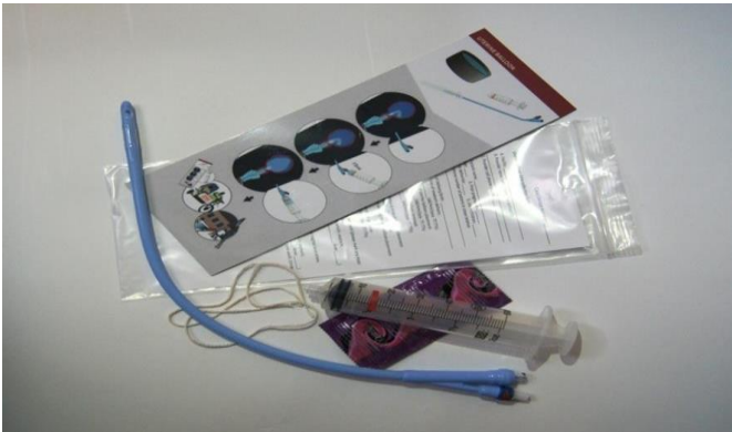
The UBT Kit

Garissa County: Provision of Uterine Balloon Tamponade (UBT) services at the Health facilities in managing uncontrolled Postpartum Haemorrhage (PPH) in an effort to reduce maternal deaths. It entails insertion of a balloon into the uterine cavity and inflation to achieve a tamponade effect.