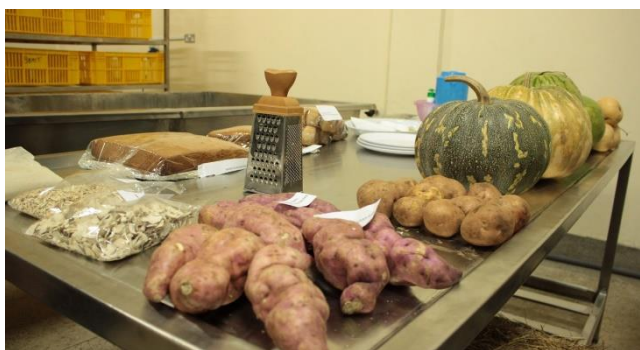
Sweet potatoes and other raw materials for processing in Bomet County

Bomet County: Sweet potato Value Addition. The main reason for this cottage was to empower sweet potato farmers in their cooperatives societies, to get premium products that can get global market hence attracting premium prices. The potatoes are dried and milled to form flour which is in turn baked to bread.